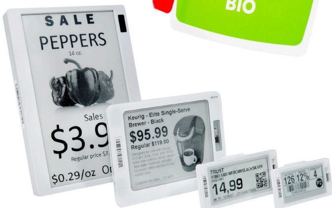
Pricer SmartTAG™ label range (graphic displays)