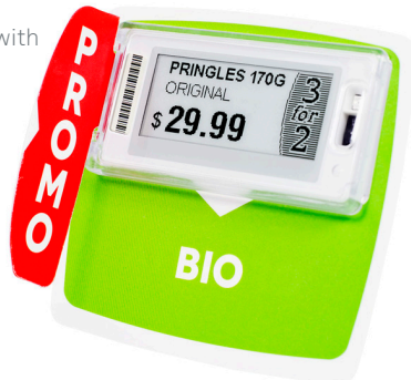
Pricer SmartTAG™ label with promotional information (SmartFRAME)